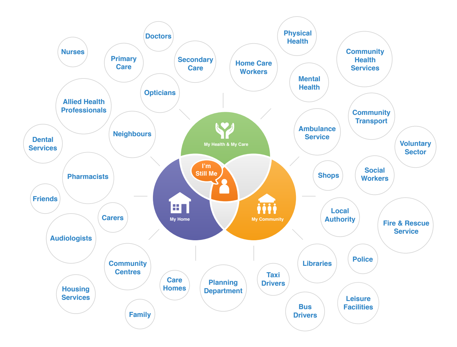
Figure 2 below represents the range of people and services to whom this framework applies:

In particular, by using the framework to inform the design of education and training curricula, universities and colleges can ensure that the core capabilities are appropriately reflected within intended learning outcomes. This will help ensure that students on placements or new graduates entering the workplace have already gained the core capabilities when they enter practice and when practitioners prepare to take on a new role.